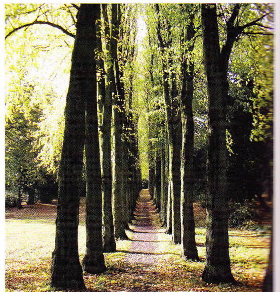
Lady Lucy's Walk at Wentworth Castle Gardens