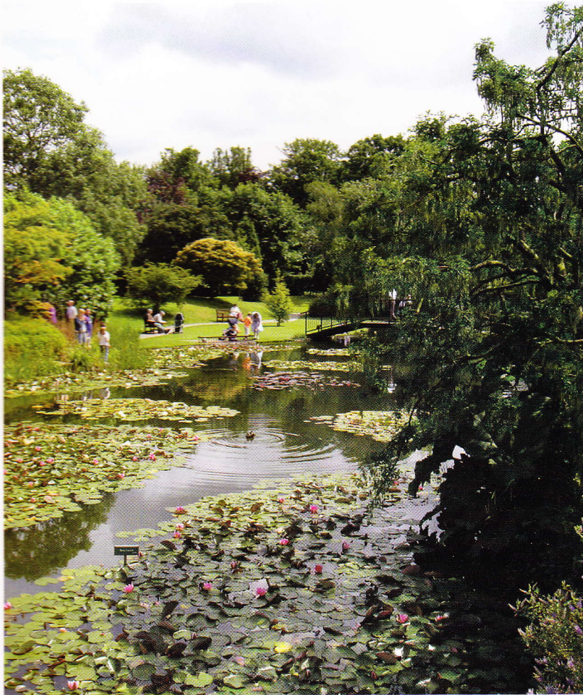
Burnby Hall Gardens